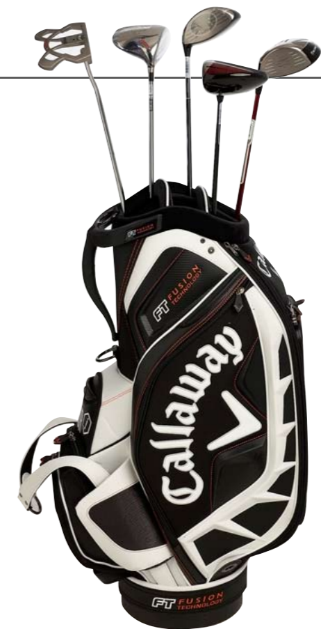
TOP GEAR: Callaway 10" Tour Bag (rrp $499); clubs clockwise from left: Ping Wack-e putter ($269); Cleveland DST Driver ($379); Callaway FT-i-z Driver ($549); Callaway Diablo Edge Driver ($369); TaylorMade r9 460 Driver ($499).

Thanks to Mike Glover, at Golf Box East Perth (cnr Newcastle and Lord Sts, (08) 9421 8000) for supplying the golf equipment and clothing. For details on other Golf Box stores, see golfbox.com.au or email sales@golfbox.com.au .