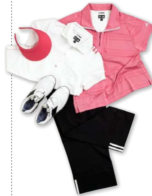
HERS: (above, clockwise from bottom) adidas ClimaCool 3/4 pants in black ($119); Footjoy Contour Shoes in white/black ($199); adidas ClimaCool Polo in white ($89); Slip on golf visor ($19); adidas ClimaCool polo in pink ($89).

He sums up the beauty of golf thus: "You can play on your own, or with partners. You can play socially, or if you're competitive, against someone who is a lot better because the handicap system is the best and fairest in any sport played.